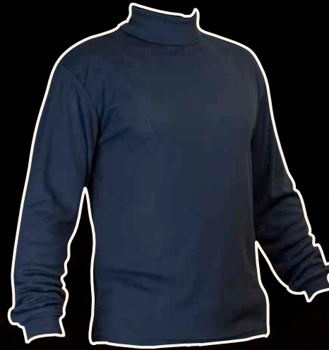
Long Sleeve Roll Neck Shirt