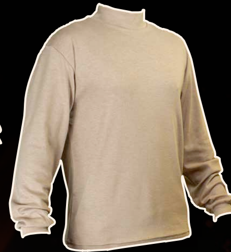
Long Sleeve Turtle Neck