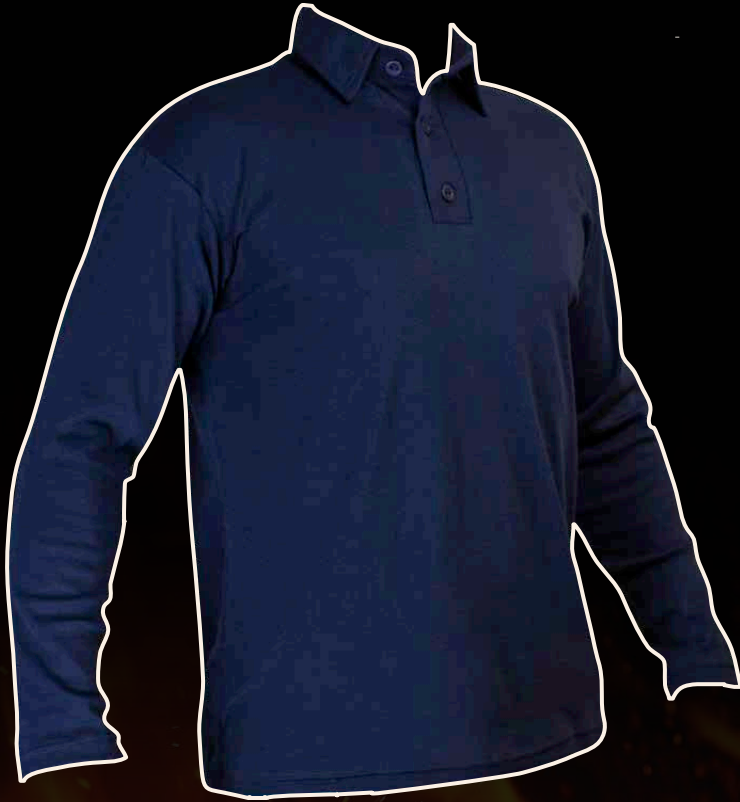
Long Sleeve Polo Shirt