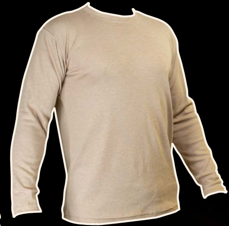
Long Sleeve T-Shirt