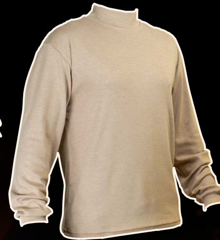
Long Sleeve Turtle Neck