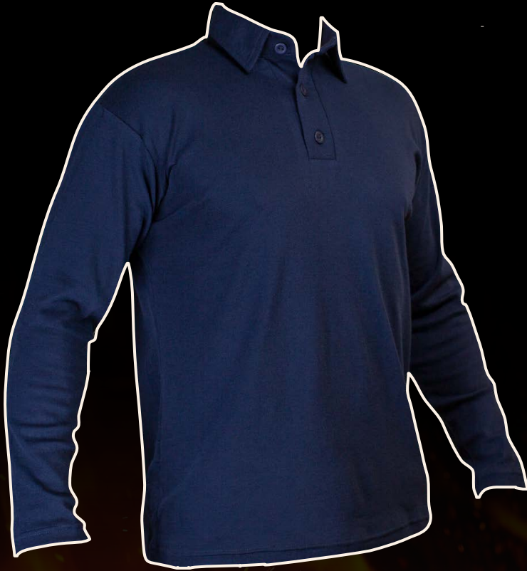
Long Sleeve Polo Shirt