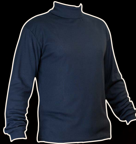
Long Sleeve Roll Neck Shirt